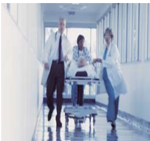
Health care professionals have the opportunity to manage a patient in real time and see the results of their treatment.

Vital signs can be assessed, IV lines and NG tubes inserted, EKGs interpreted, defibrillation practiced, and emergency medications administered and results evaluated.